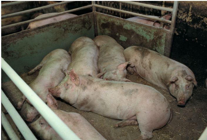
Figure 2. The faecal-oral route illustrated by finishing pigs. Pigs have normally quite hygienic habits, but these are sometimes hard to maintain in an ordinary fattening pen..

Salmonella spp. may enter the ‘feed-to-fork’ chain at different levels and in different ways. The transmission of the infection is facilitated by low hygiene standards and/or dense populations facilitating faecal contamination of food, feed or the environment (Figure 2).