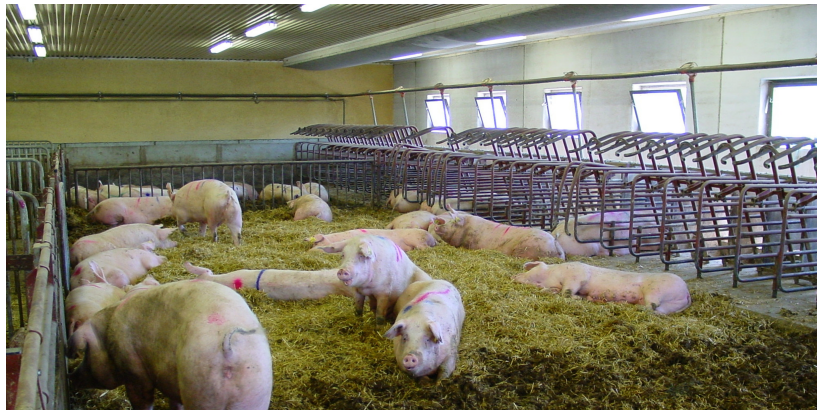
Figure 3. Sows in gestation.

Sows farrow in pens with a minimum area of 6 m 2 . Fixation crates have not been allowed for the past 20 years. Male piglets are castrated, whereas tail docking has never been practised and is prohibited by law. On average, weaning of the piglets is performed at 34 days of age, the minimum age allowed is 28 days. There is a ban on using fully slatted floors, which have never been used for pigs in Sweden. The use of straw for all pigs is regulated by law. Deep straw bedding in non-heated free stalls for gilts and pregnant sows is widely used (Figure 3).