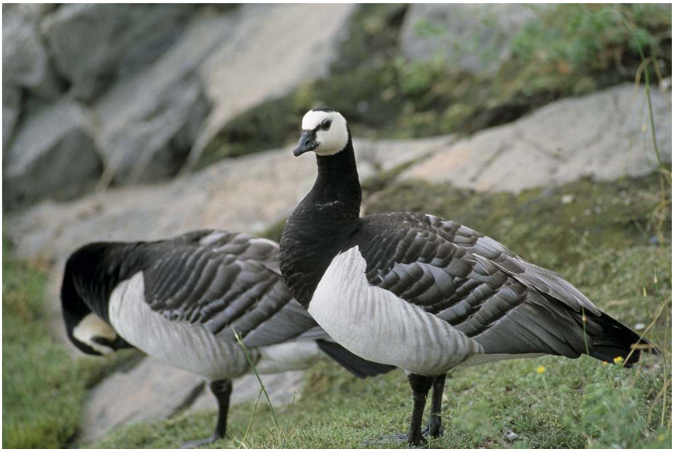
Seven wild birds were found positive for highly pathogenic avian influenza (HPAI) in 2020, of which five were barnacle geese.

In May 2005, an outbreak of HPAI H5N1 led to the death of over 6000 migratory waterfowl in Qinghai Lake in western China. This was the first sustained major outbreak with HPAI H5N1 viruses within wild bird populations since 1997. Subsequently, HPAI H5N1 outbreaks in wild birds or poultry were reported in Siberia (July 2005), Mongolia and Kazakhstan (August 2005), Romania, Croatia, and Turkey (October 2005). Wild bird infections with or without poultry