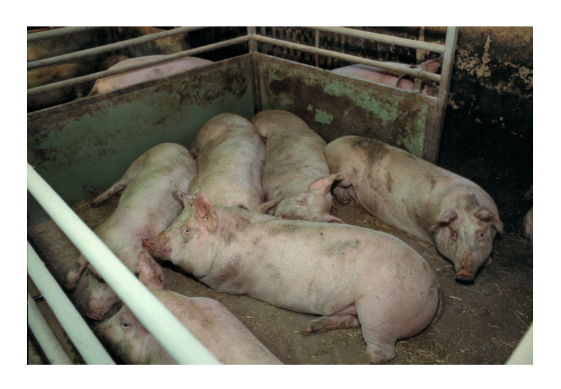
Figure 2 . The faecal-oral route illustrated by finishing pigs. Pigs have normally quite hygienic habits, but these are sometimes hard to maintain in an ordinary fattening pen.

Salmonella spp. may enter the 'feed-to-fork' chain at different levels and in different ways. The transmission of the infection is facilitated by low hygiene standards and/or dense populations facilitating faecal contamination of food, feed or the environment (Figure 2).