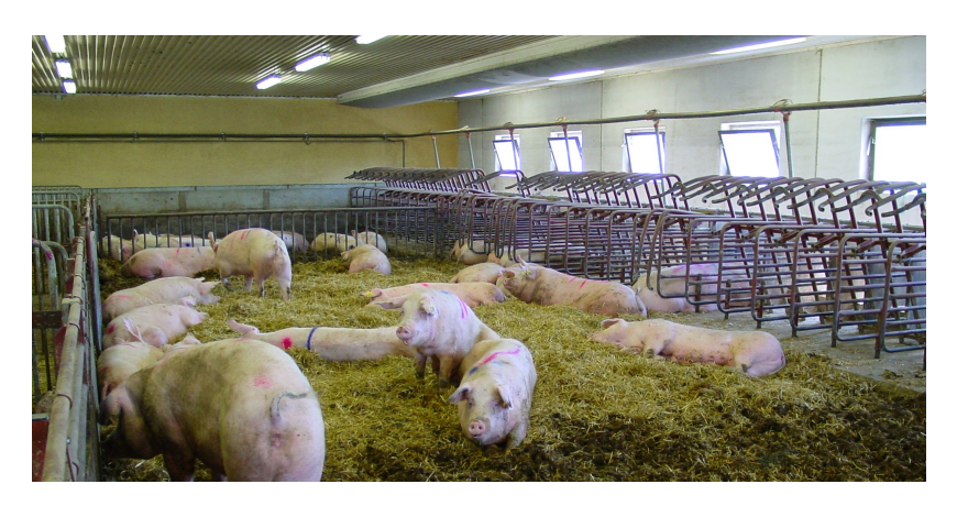
Figure 3. Sows in gestation. (Photo: SVA).

Sows farrow in pens with a minimum area of 6 m<sup>2</sup>. Fixation crates have not been allowed for the past 20 years. Male piglets are castrated, whereas tail docking has never been practised and is prohibited by law. On average, weaning of the piglets is performed at 34 days of age, the minimum age allowed is 28 days. There is a ban on using fully slatted floors, which have never been used for pigs in Sweden. The use of straw for all pigs is regulated by law. Deep straw bedding in non-heated free stalls for gilts and pregnant sows is widely used (Figure 3).